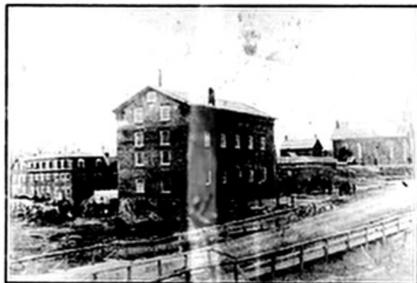
Fig.1 Circa 1880