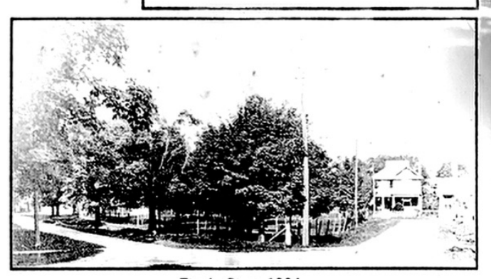
Fig.4 Circa 1924

BROOKLIN DOWNTOWN BUSINESS ASSOCIATION WITH COMMUNITY SUPPORT